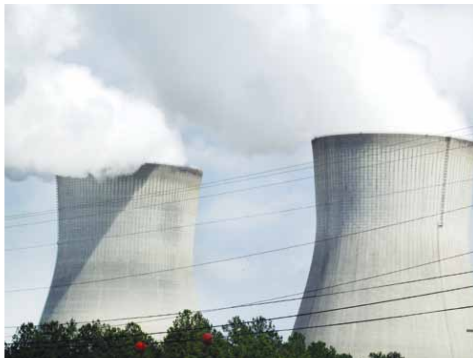
Cooling towers for nuclear power plants in Shell Bluff, Georgia.

Occupy the PGA! IT IS NOT ABOUT ONE THING. IT IS ABOUT EVERYTHING! LET'S TAKE OVER THE TAKEOVER!