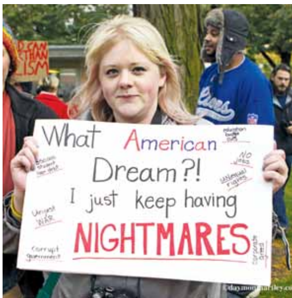
Occupy Detroit

That Dream never worked for everyone, and as employers relentlessly slash benefits and cut back wages it is not working any more for millions of people. It is not their fault that despite their heart and hard work, they are not able to earn enough to house, feed, transport, educate and keep themselves and their families healthy. We have record levels of unemployment, poverty, homelessness and hunger. The safety net programs that guarantee people their human rights in compassionate societies have been shredded and powerful forces push to eliminate them completely.