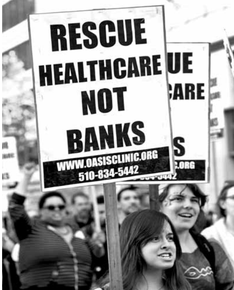
Occupy Oakland General Strike, November 2, 2011.