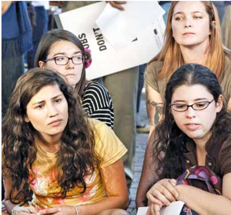
Occupy Oakland General Strike, November 2, 2011.