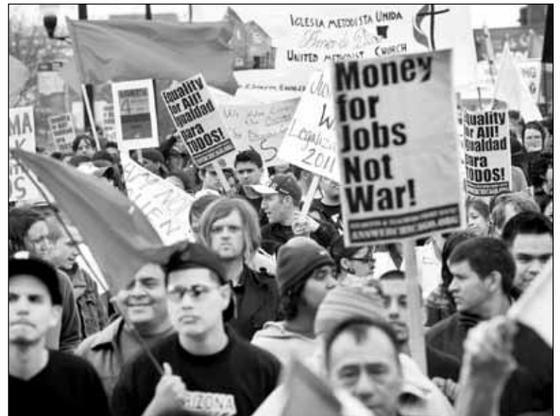
May Day 2011 in Chicago.