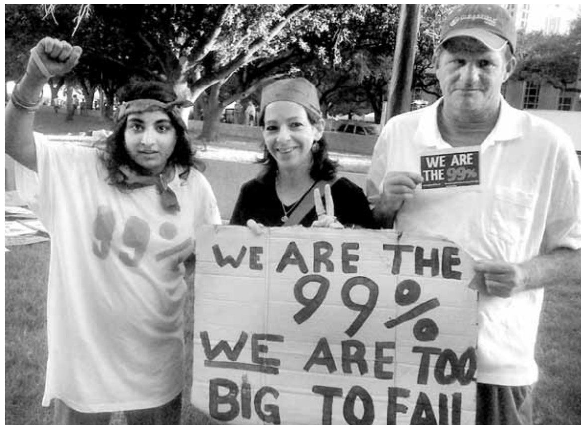
Occupy Houston protest of the big oil companies in front of Houston City Hall.