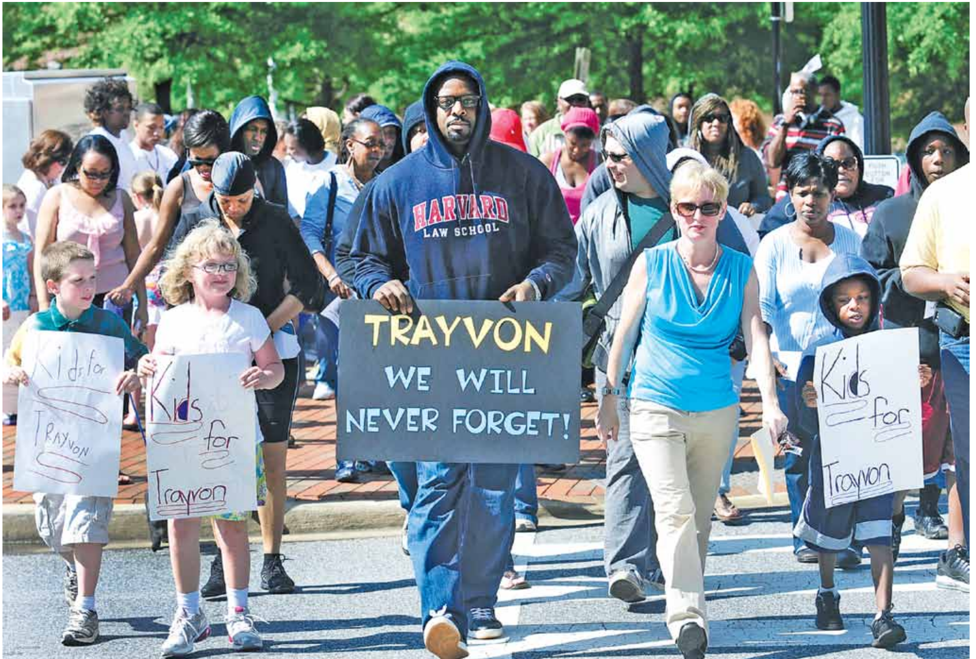
People gather in Spartanburg, S.C. to raise awareness about the murder of Florida teen Trayvon Martin.