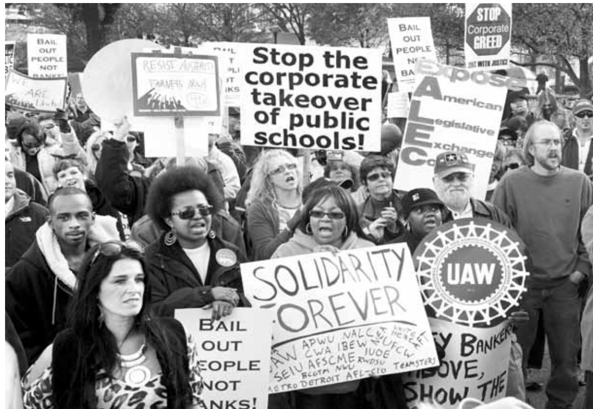
Occupy Detroit march and rally in downtown Detroit. The rally was supported by the UAW and AFL/CIO last fall. Almost 1,000 people were in attendance.

When the House Republicans recently passed a law eliminating union dues deduction from teachers pay checks, they needed 72 votes (in a separate motion),