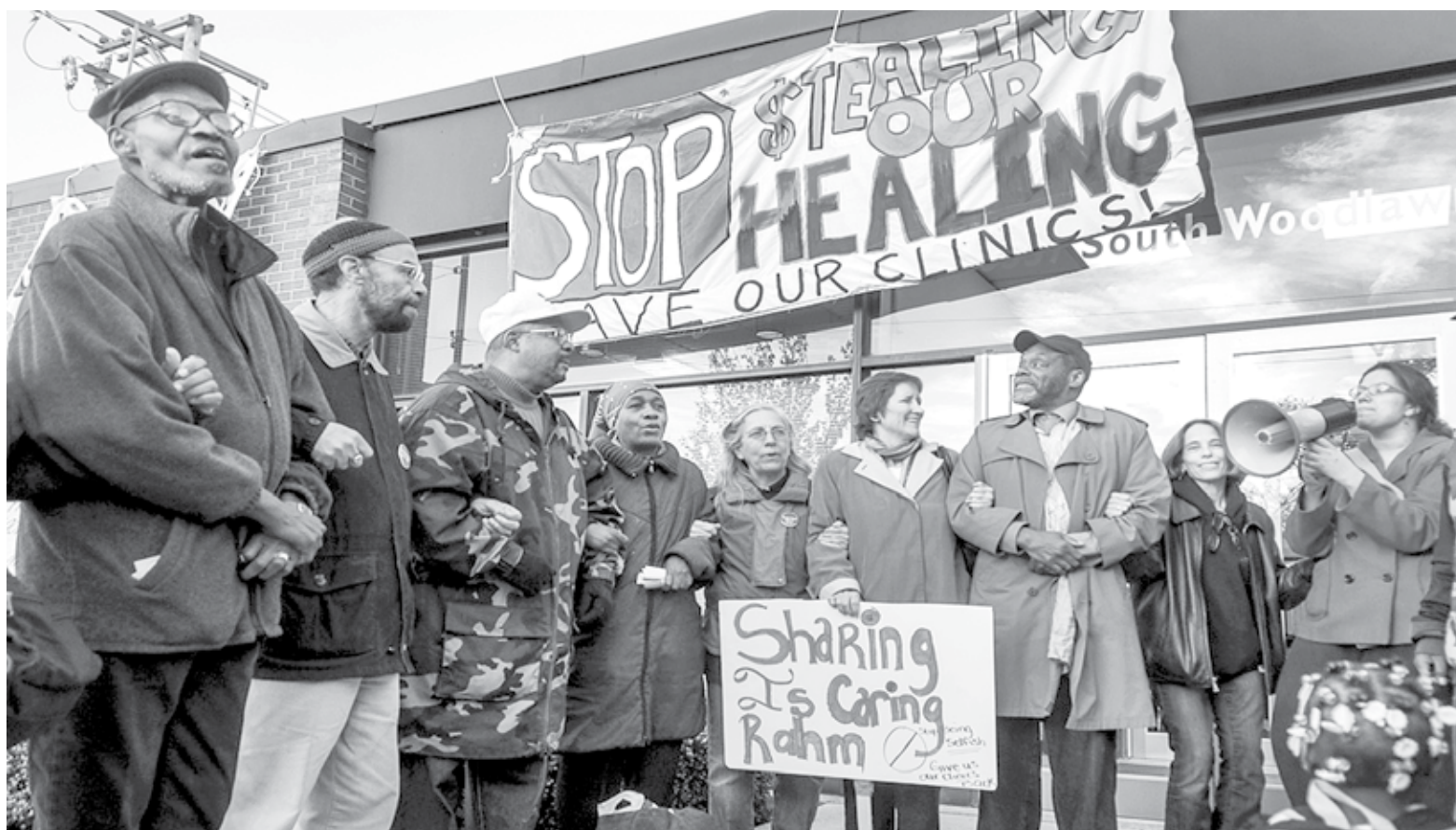
Mental Health Movement and their allies barricaded themselves inside Chicago's Woodlawn Clinic and set up a tent city outside to protest the closure of half of the city's mental health clinics. Follow on Twitter: #SaveOurClinics