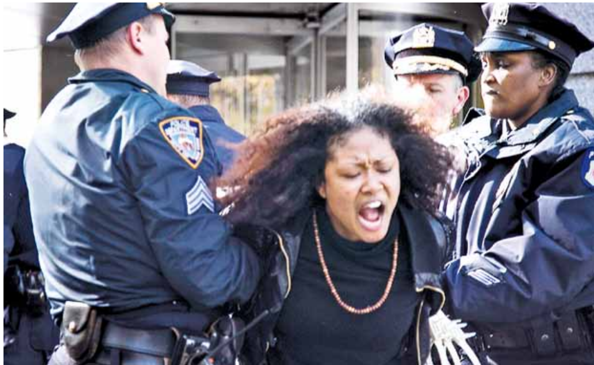
Occupy Wall Street sit in at Goldman Sachs in New York

Another trend is the tendency of government—local, state and federal—to be mindful of the needs of big money and neglect the demands of the citizens that put them in office. What will it take for the people to get their resources returned into