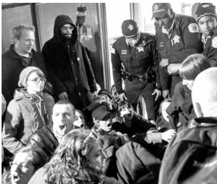
Protesters and police clash outside the Woodlawn Clinic.

to save our city's mental health clinics after attending a sit in with the MHM at City Hall. Occupy Chicago was supporting those sitting in and I was so moved by what I heard, and by the gravity of what these people were facing, that by