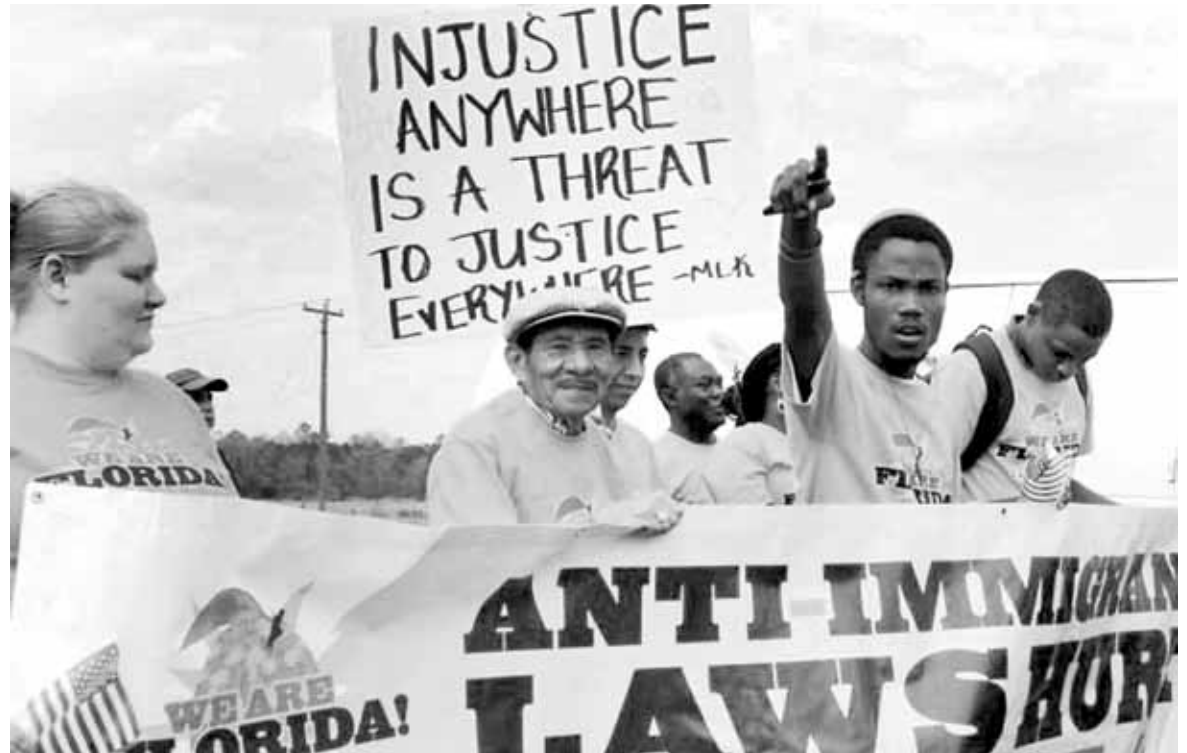
Thousands commemorate the historic 1965 civil rights marches from Selma to Montgomery that culminated with the passage of the Voting Rights Acts. Banners called for the defense of voter and immigrant rights.

Migration has become the catch-all scapegoat for domestic