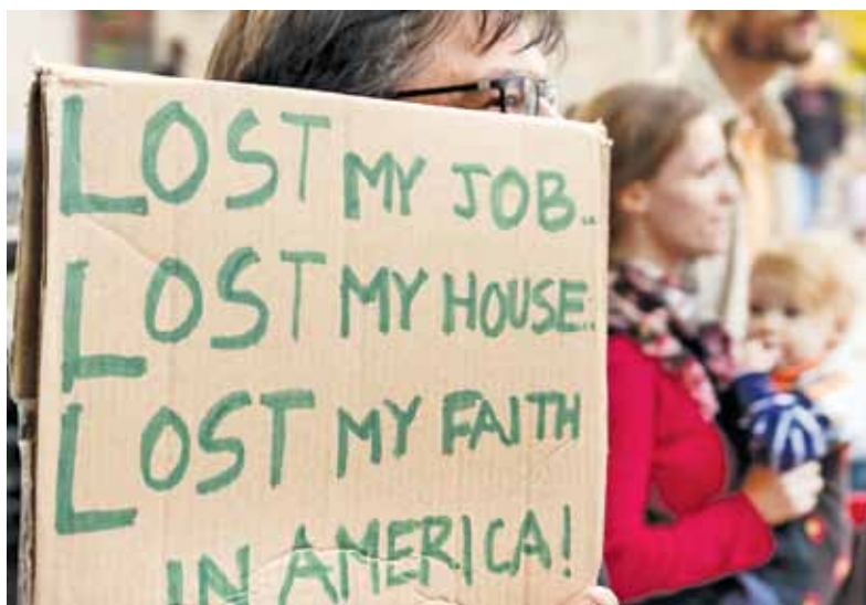
Occupy Providence, Rhode Island

Myth: Government programs forced banks to loan to “uncreditworthy” people like minorities and women. Fact: Predatory banks could “do bad all by themselves.” The housing bubble was created by unregulated Wall Street profiteers who created irresistible incentives to bundle subprime mortgages into worthless bonds and credit default swaps. Rating companies were paid off to give them false triple-A ratings, and subprime lenders were encouraged to openly lie about consumer loan qualifications. The Federal Reserve Bank stimulated the entire process by artificially lowering interest rates. Fannie Mae, Freddie Mac, and banks regulated by the federal Community Reinvestment Act all got involved