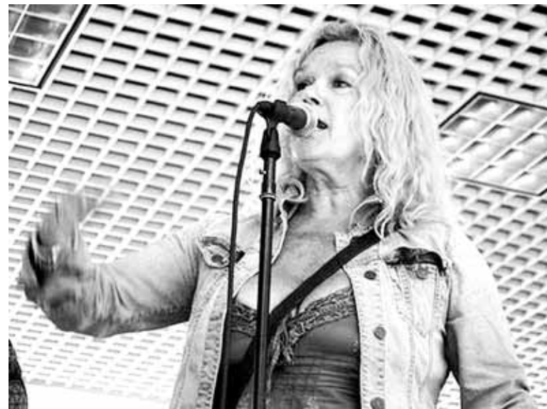
(Right) Performer with Revolutionary Poets Brigade.