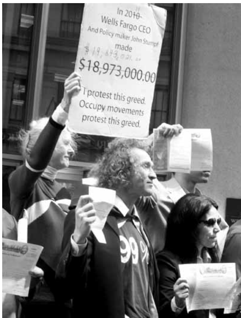
Protesters who had encircled a San Francisco Wells Fargo after their release from jail.