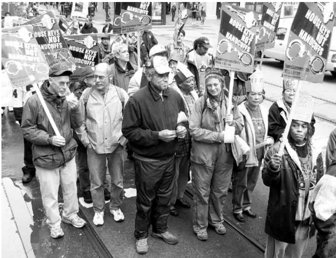
“House Keys not Handcuffs” March in San Francisco in 2010, organized by the Western Regional Advocacy Project (WRAP).