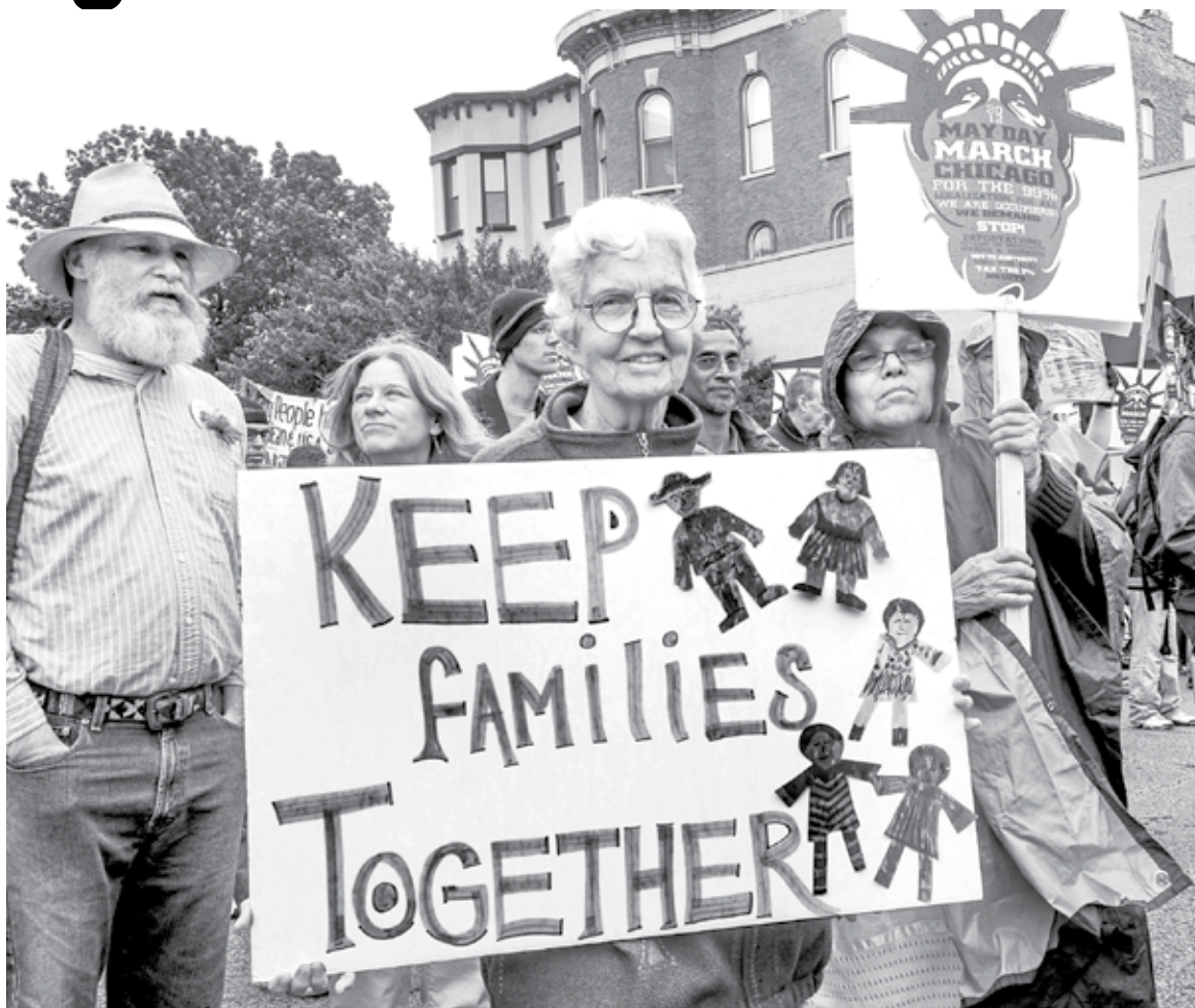
Chicago demonstrators marched for immigrant rights and workers’ rights, joining protests around the world on May 1, 2012, International Workers Day.

As a result, 50 million people in the U.S.—immigrant and non-immigrant—or one in six, are without healthcare when enough quality healthcare exists for everyone. Millions struggled to put food on the table last year at a time when mountains of food are produced. Growing numbers of people are going without water or heat in their homes at a time when energy corporations are making billions in profit. Something has to give.