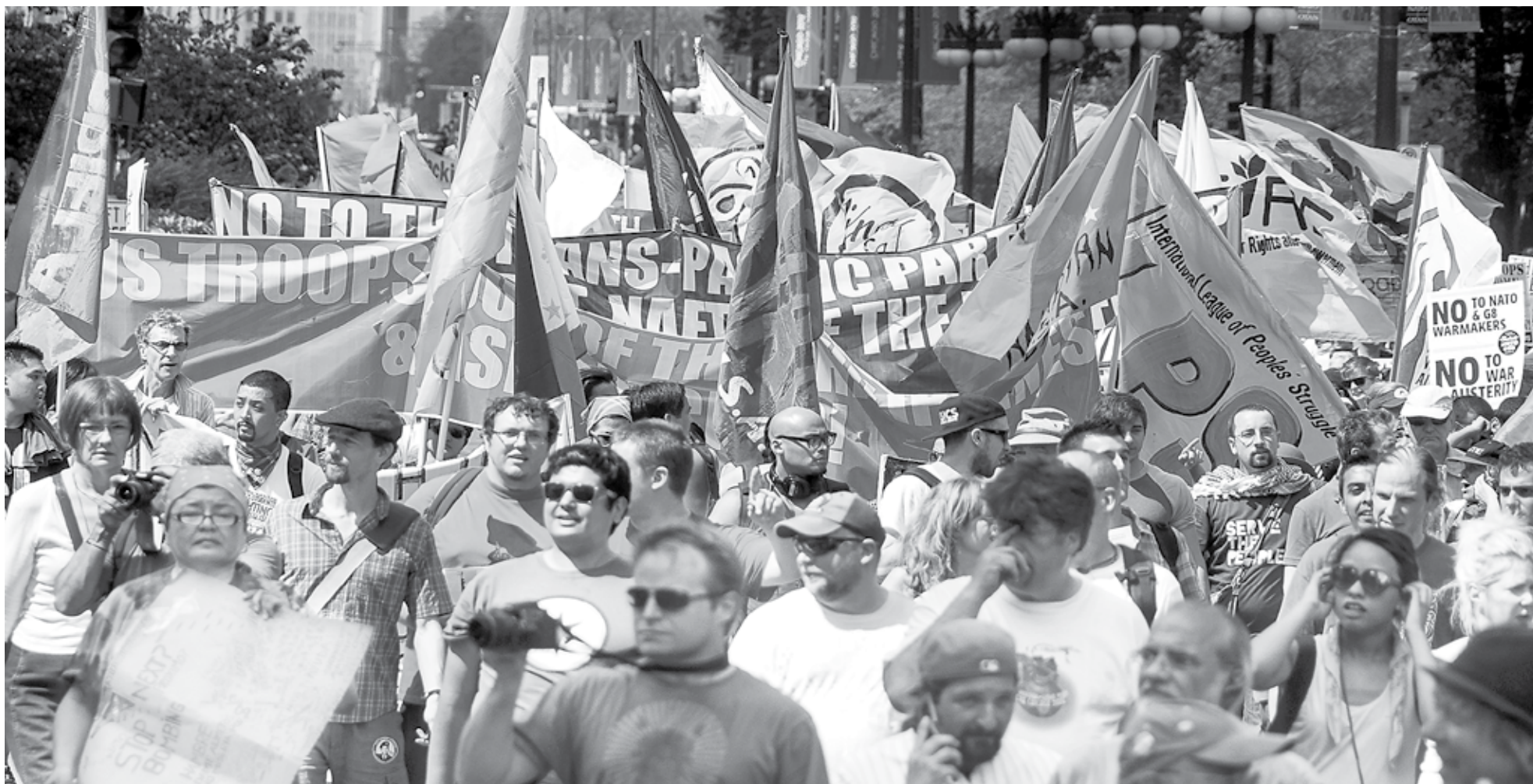
People from around the world filled the streets of Chicago to protest the North Atlantic Treaty Organization (NATO) and austerity.