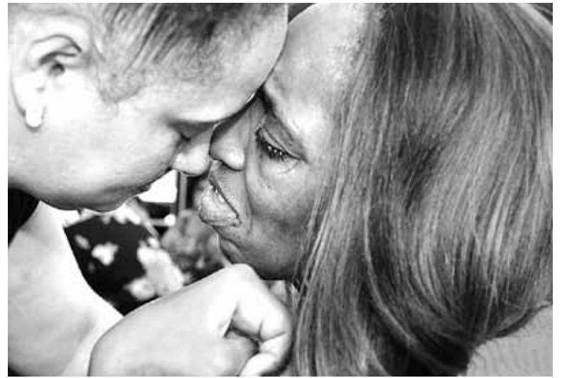
Women console each other after testimony at the World Courts of Women on Poverty.

Doing that requires a massive workers' movement dedicated to putting the resources the 99% need into the public domain. The reality is that powerful corporate