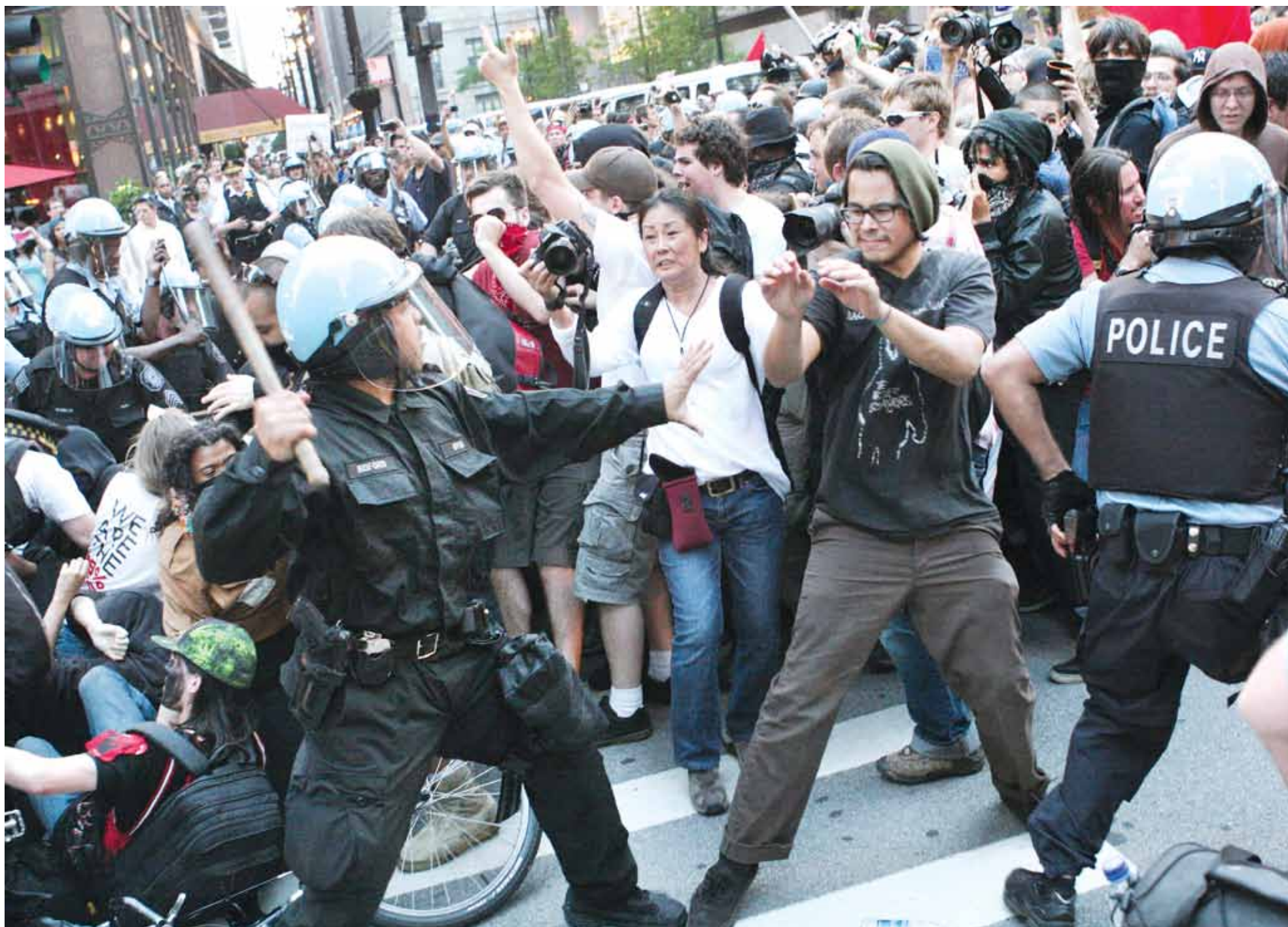
Chicago Police strike out against protesters and journalists during the week of action protesting against the NATO Summit.