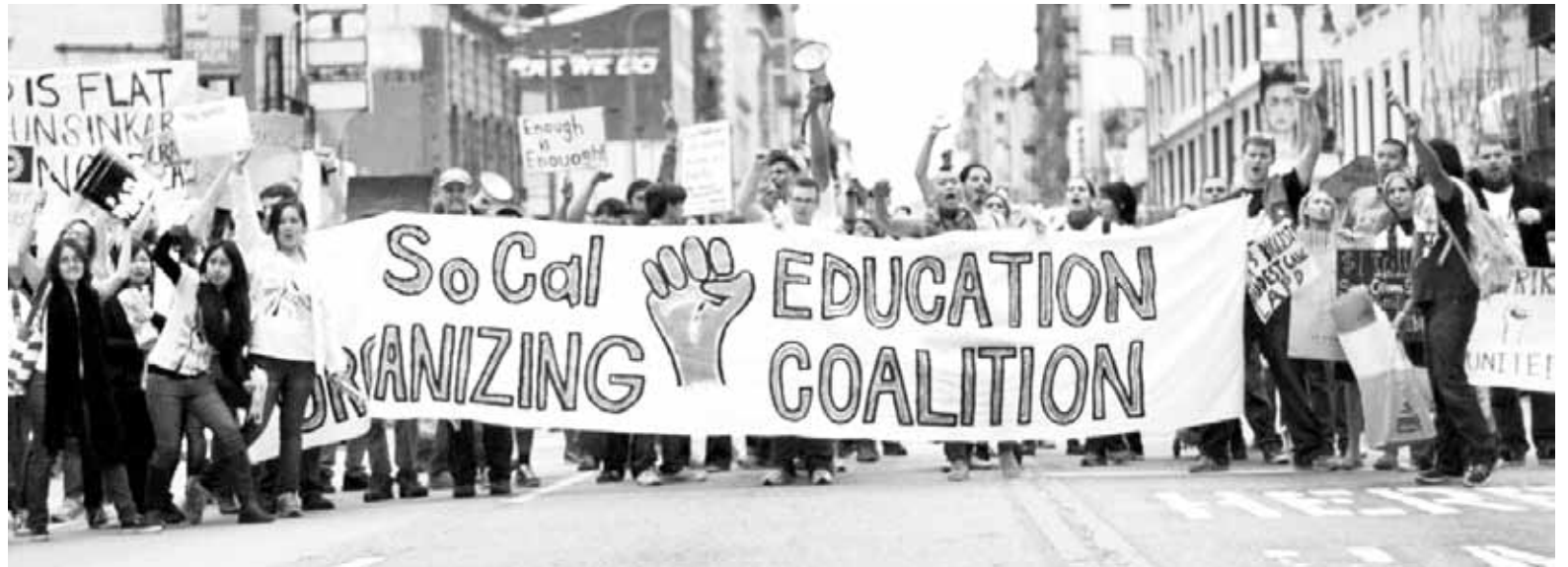
Education protest downtown Los Angeles. March coincided with the Occupy May 1 event.

It's hard to believe that less than 50 years ago, education in California was amongst the best in the world, not to mention the fact that it was practically free. We had the funding then, but what changed? In 1978, a 1% cap was placed on property taxes which mainly benefited the wealthiest of Californians at the expense of Public ED. The war on drugs, accompanied by the expansion of law enforcement and the justice system was taking shape around this time. Colleges were militarized by Campus Police and activist activities repressed. Public schools began to be occupied by law enforcement and juveniles began