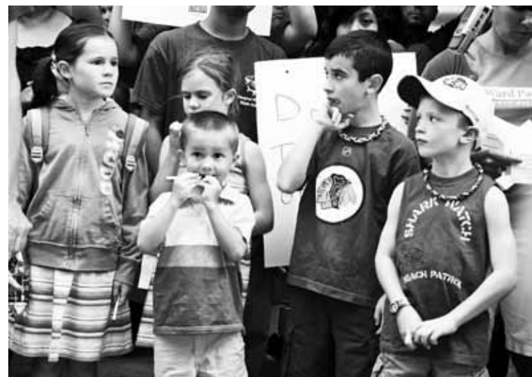
The community rallies at last Chicago Board of Education meeting of the school year to support teachers and the Chicago Teachers Union and to demand an elected representative school board.

class to have a liberal education. We want another class, a very much larger class of necessity, to forgo the privilege of a liberal education and fit themselves to perform specific difficult manual