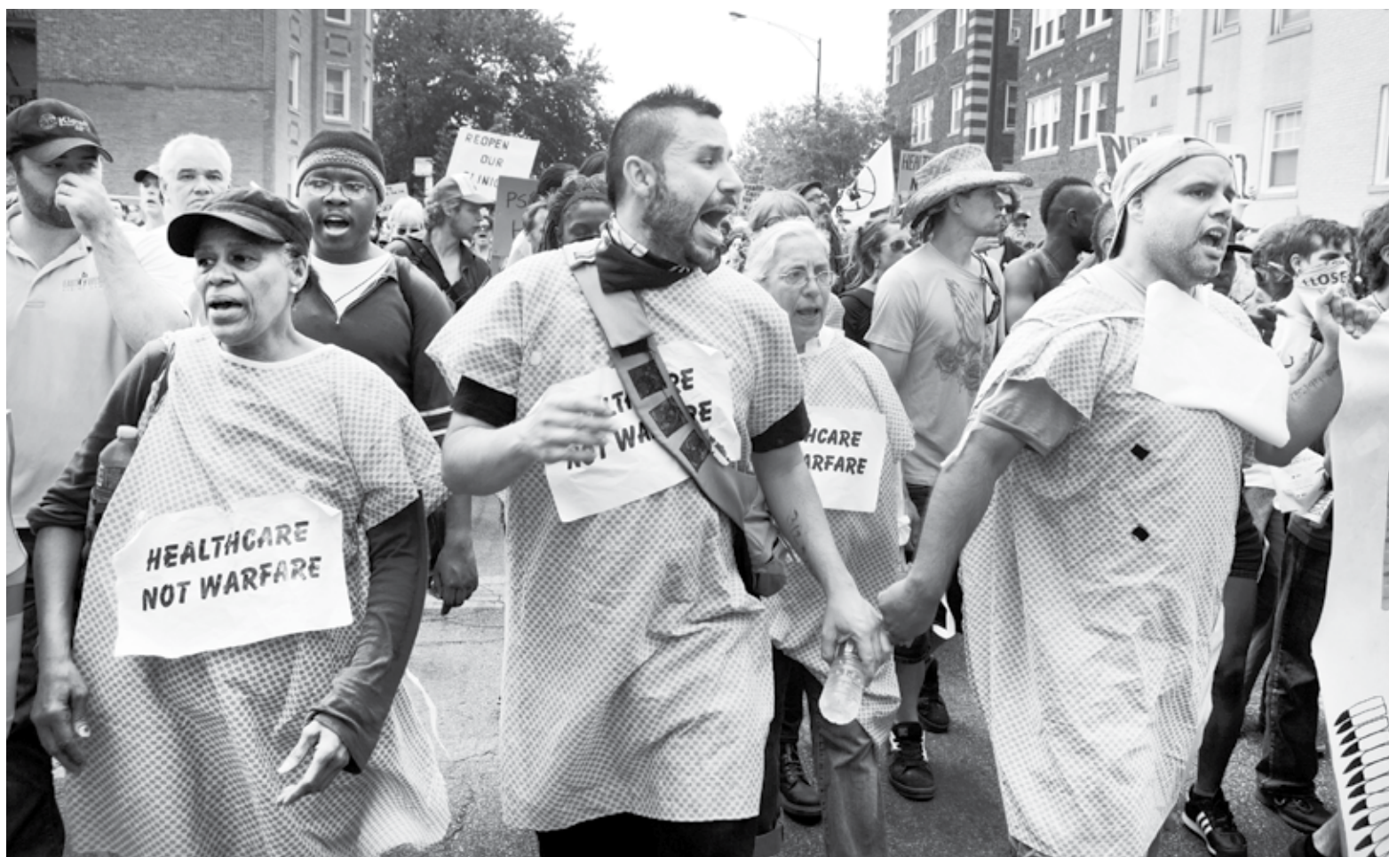
Protest in Chicago for healthcare, not war.