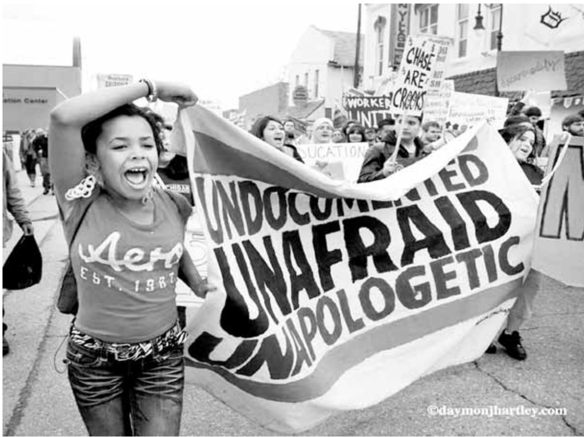
May Day rally in Michigan. Undocumented workers are stigmatized and hunted down, reminiscent of the Nazi pogroms of Hitler's time. An attack on the undocumented deflects anger from the real problem—corporate control of government.