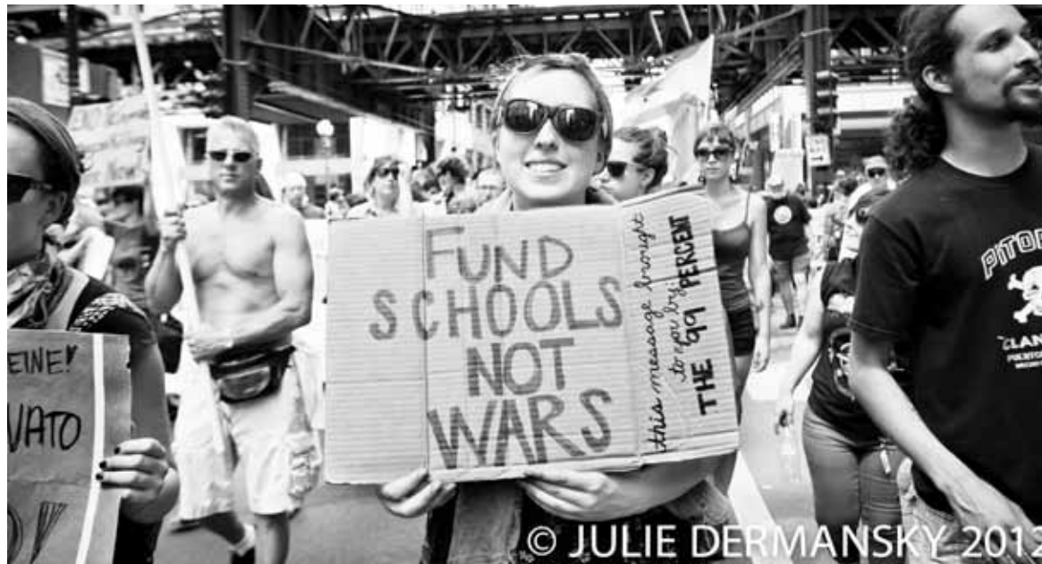
Chicago is the only public school system in the country with Air Force, Army, Navy, and Marine Corps high school academies.

Military generals running schools, students in uniforms, metal detectors, police presence, high-tech ID card dog tags, real time Internet-based surveillance cameras, mobile hidden surveil-