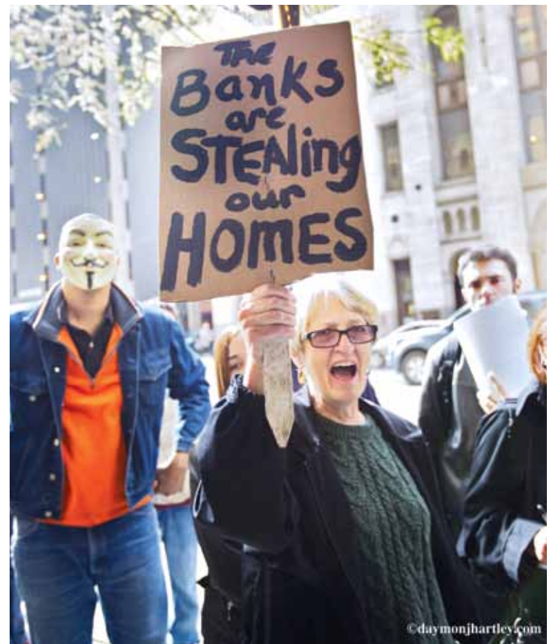
Occupy Wall Street protest, Detroit.

The capitalist system cannot provide for us. This is proven in its long term failure to create living wage jobs, regardless of who is in power. This is not a Democratic or Republican issue and cannot be resolved under this eco-