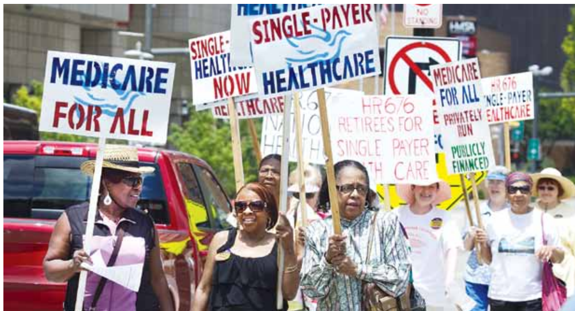
A National Health Service, a planned and publicly owned delivery system in our interests not the corporations, is needed.