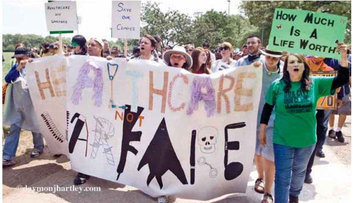
Healthcare protest in Detroit, MI.