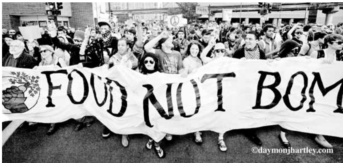
Food not Bombs at the anti-Nato protests in Chicago.

For more information, or to order this book, please contact: Courage to Resist , 484 Lake Park Ave. #41, Oakland, Ca. 94610 www.couragetoresist.org (510)488-3559