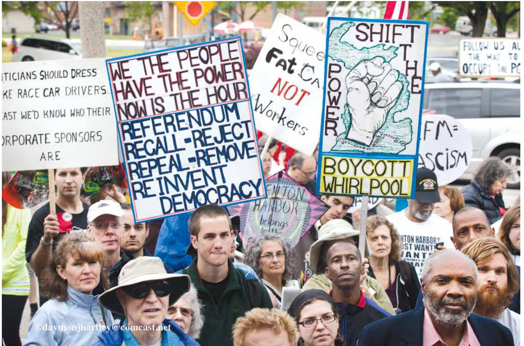
Protest in Benton Harbor, MI., against Whirlpool's theft of the town's lakefront property and the attack on democracy.