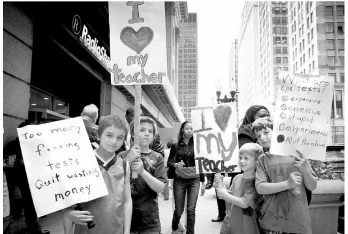
Protest against public education cuts in Chicago. Public schools must have government funding to provide every child with a quality education.

The people of the state of Georgia will vote in November whether or not to have a state agency established that would be able to set up charter schools